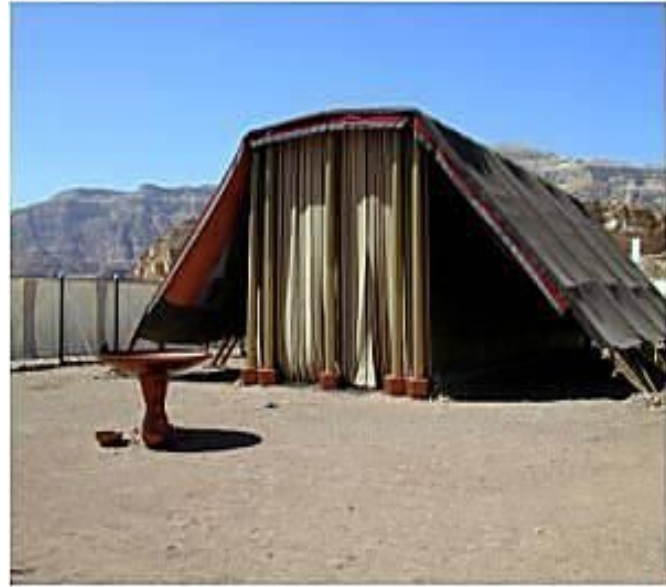
Tabernacle from above '(A Tabernacle is a 'Tent') Tabernacle with Bronze Laver God is 'tenting' with His people Israel.